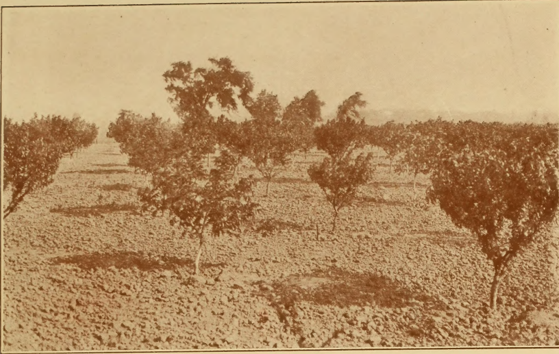
Photograph taken Spring 1911 of an orchard of Hardy Pomeroy English Walnut Trees

on the Pomeroy Farm, Lockport, N. Y., with peach trees used as fillers.